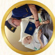
LAST PATROL VOLUNTEER READS A PERSONAL LETTER TO A VETERAN IN HOSPICE.

OUR MISSION IS PROVIDING FRIENDSHIP, HONOR, AND SUPPORT FOR VETERANS ON THEIR LAST PATROL. YOU CAN HELP US SUPPORT THESE SPECIAL VETERANS AND CELEBRATE THEIR SERVICE BY ATTENDING OUR 4TH ANNUAL VETERAN'S LAST PATROL DINNER. SPONSORSHIPS ARE AVAILABLE AND THE DINNER WILL INCLUDE A SILENT AUCTION.